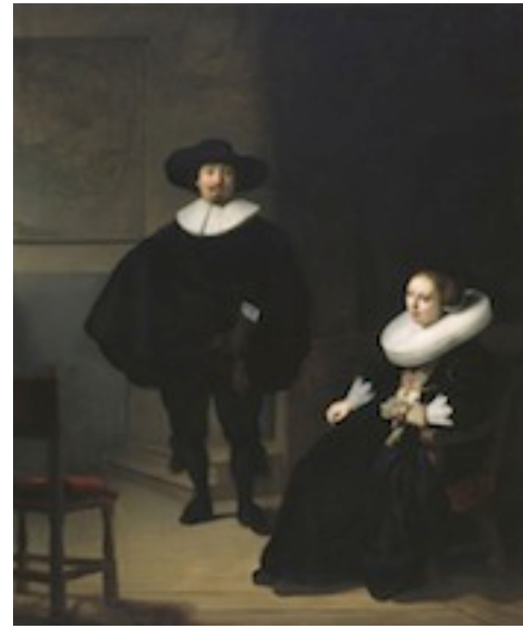
A Lady and Gentleman in Black Rembrandt