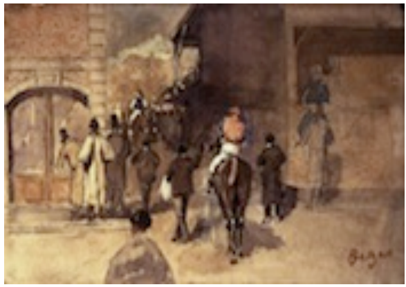
La Sortie de Pesage Edgar Degas

A Guide to the art world's biggest unsolved mystery