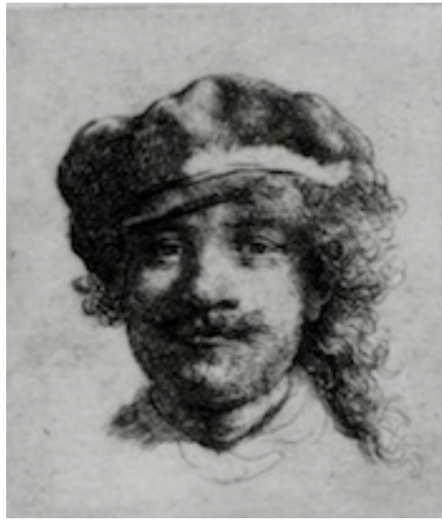
Self Portrait Rembrandt