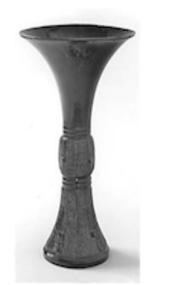
Ancient Chinese Ku Shang Dynasty