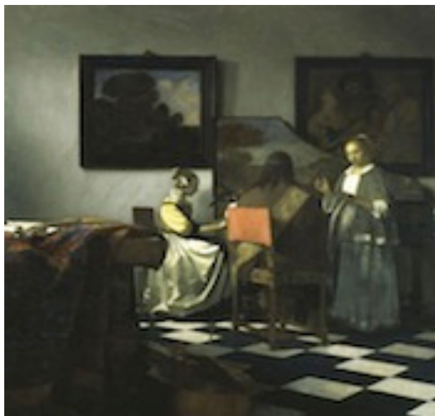
The Concert Johannes Vermeer

"What is it like to be a stolen painting- ... Think of how bored they get, stacked in the warehouse somewhere ... Only criminals know where they are... Why have we been stolen? they ask themselves. Who has benefitted? Or do they hang admired in some sheikh's sandy palace, or the vault of a mad Manila tycoon?"