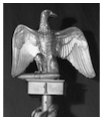
Eagle-shaped finial from Napoleonic flag