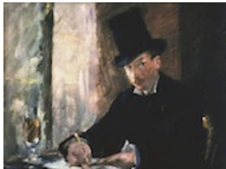
Chez Tortoni Édouard Manet