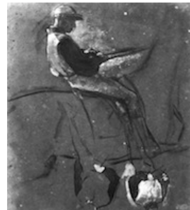
Three Mounted Jockeys Edgar Degas