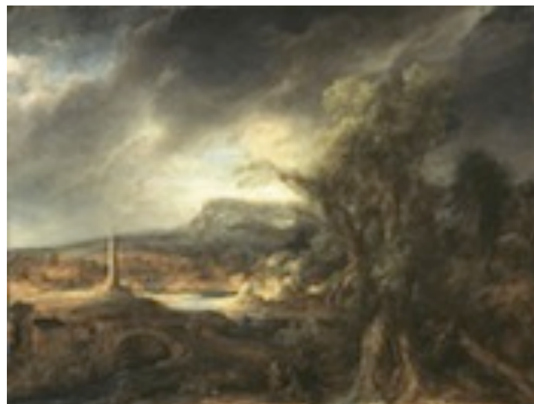
Landscape with Obelisk Govaert Flinck