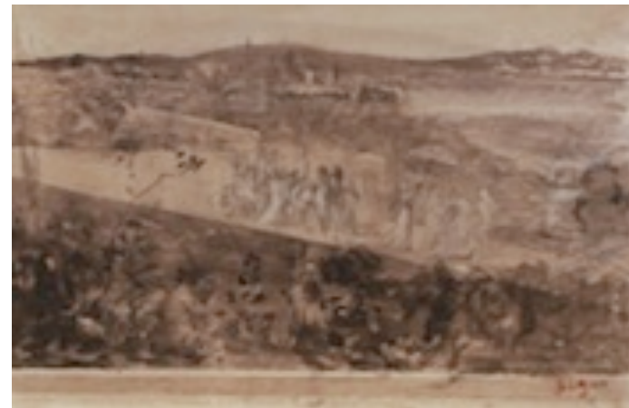
Cortège aux Environs de Florence Edgar Degas