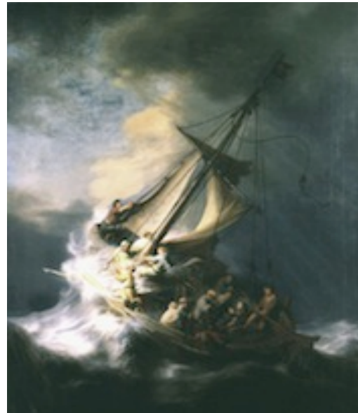
The Storm on the Sea of Galilee Rembrandt

In the early morning hours of March 18th, 1990, while virtually every other Bostonian lay drunk in gutters or passed out in their beds, two men dressed as Boston Police officers conned their way into the Isabella Stewart Gardner Museum by telling guards they were responding to some type of disturbance. The men spent a total of 81 minutes inside the museum, and made off with thirteen (13) works of art currently valued at over $500 million. In 2013, on the 23rd anniversary of the heist, the FBI announced that they knew who committed the crime. But they won't name names. And the whereabouts of the artwork remains a mystery.